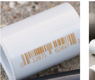
Laser code (colour change)

Printed codes and marks are often the most visible indicator of your brand values and product quality. The legibility and appearance of logos, production and time stamps, bar codes and other marks can all contribute to perceived quality.