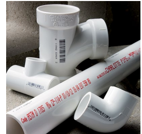
Continuous inkjet codes